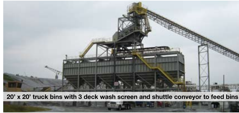
20' x 20' truck bins with 3 deck wash screen and shuttle conveyor to feed bins