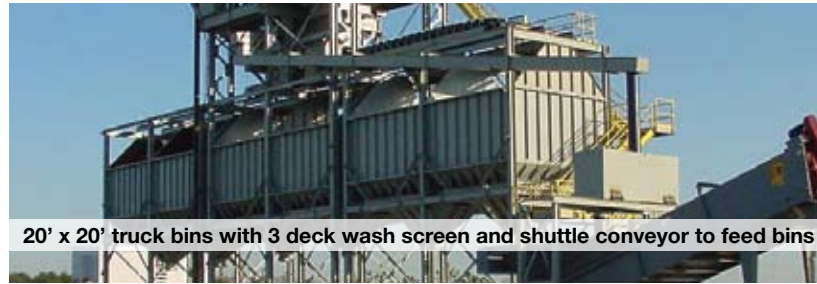
20' x 20' truck bins with 3 deck wash screen and shuttle conveyor to feed bins