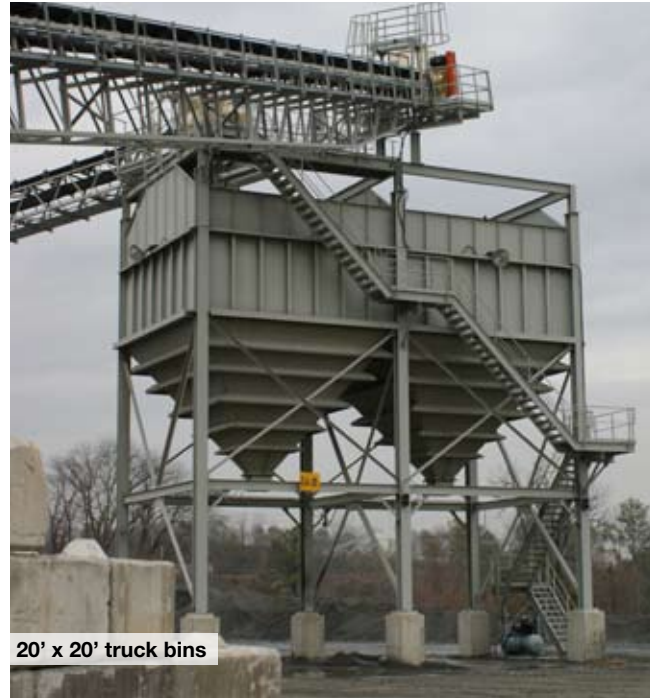
20' x 20' truck bins