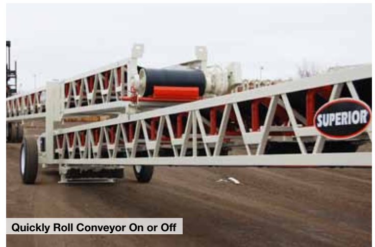
Quickly Roll Conveyor On or Off