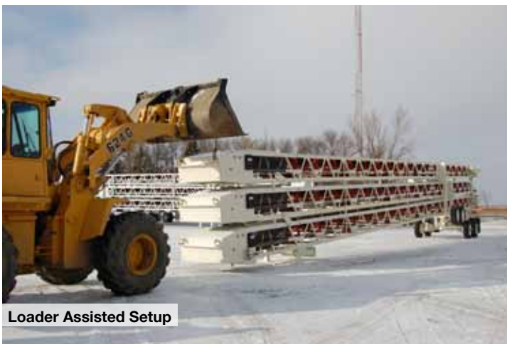
Loader Assisted Setup